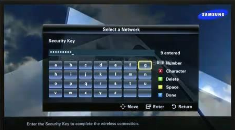
<u>Step 9</u> Your Samsung TV will attempt to connect to your Wi-Fi

<u>Step 8</u> Enter your WiFi password and press the Blue button on your Samsung remote